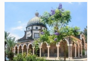
Mount of the Beatitudes beside the Sea of Galilee.