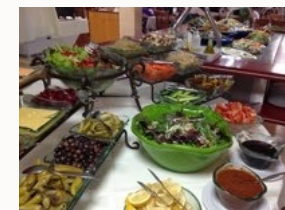
Breakfast & Dinner at our hotel. Lunch at restaurants.

Cost per person (dbl. occupancy) will be approximately US$3,700 plus airfare for the primary pilgrimage. The optional Jordan extension is approx. $1250. For updates check the website. Our package will include nearly everything: transfers, hotels, portorage, guides, drivers, admissions, all meals, and even tips. All details at now online at www.trinitytour.org